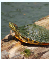
Red Eared Slider Turtle